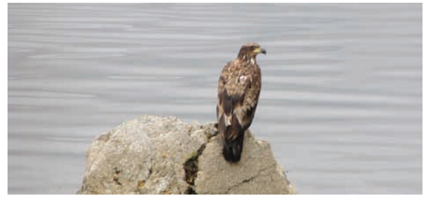
While usually spotted in trees or in the air, eagles are also seen on rocks near the water's surface.

Alaska's wildlife in a variety of ways. Respect private property and give hunters, anglers and others plenty of space.