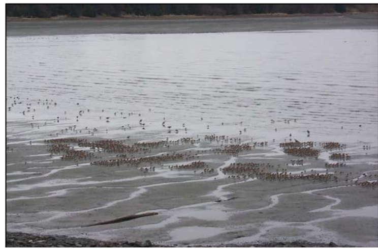
Shorebirds feeding in mudflat habitat

intertidal unconsolidated substrate habitats ranging from sheltered tidal flats to steep cobble beaches exposed to pounding waves. Each type of substrate supports a distinct biological community, including numerous species of clams, polychaete worms, amphipods, and other invertebrates. Sand and gravel beaches host