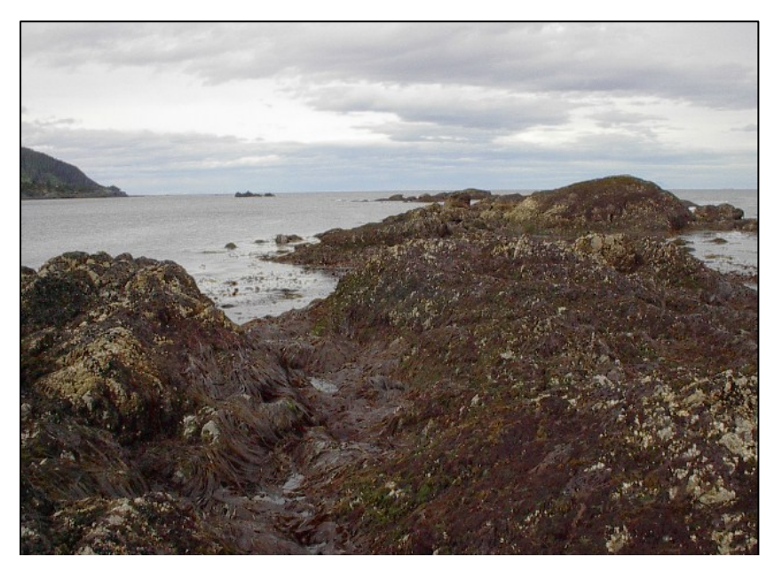
Rocky intertidal habitat at low tide, Port Graham

Macroalgal species grow in abundance during the spring and summer when extended daylight creates intense primary productivity. Their biomass supports communities that inhabit not only the rocky intertidal habitat. but also those of soft-bottom habitats (Lees et al. 1980). Direct consumers in