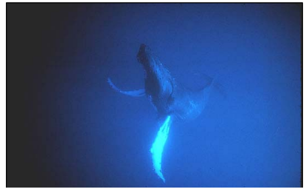
Underwater humpback whale

Red-legged Kittiwake, Rissa brevirostris Black-legged Kittiwake, Rissa tridactyla Common Murre, Uria aalge Thick-billed Murre, Uria lomvia Leach's Storm-Petrel, Oceanodroma leucorhoa Fork-tailed Storm-Petrel, Oceanodroma furcata Least Auklet, Aethia pusilla Crested Auklet, Aethia cristatella Marbled Murrelet, Brachyramphus mamoratus Kittlitz' Murrelet, Brachyramphus brevirostris Arctic Tern, Sterna paradisaea Aleutian Tern, Sterna aleutica Leatherback Seaturtle, Dermochelys coriacea Copepods: Neocalanus spp Calanus spp. Psuedocalanus spp. Acartia spp. Metridia spp. Oithona spp. Amphipods North Pacific right whale, Eubalaena japonica Baird's beaked whale, Berardius bairdii