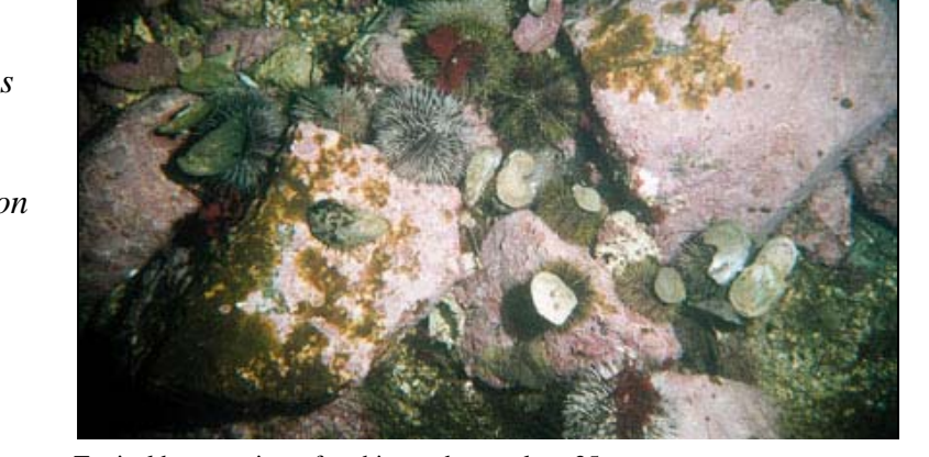
Typical bottom view of urchins and mussels at 25 m.

Clinocardium spp. Serripes spp. Corals, Tunicates and Sponges: Phylum Porifera Mactromeris spp. Phylum Cnidaria: Octocoral Families: Corallidae, Isididae, Paragorgiidae, Pennatulidae, Primnoidae Hexacoral Families: Antipathidae, Oculinidae, Caryophylliidae Hydrocoral Family: Stylasteriidae