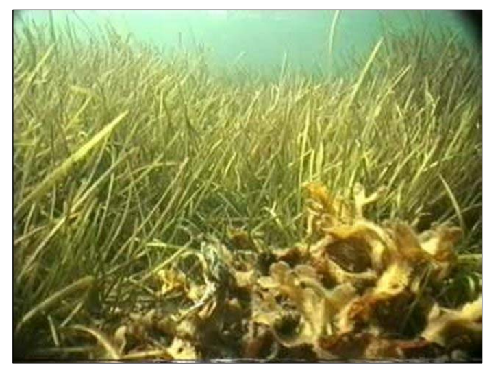
Underwater eelgrass beds, Kachemak Bay

grows in beds (clusters) in low intertidal and shallow subtidal sandy mudflats. Like a coral reef or kelp forest, the physical structure of the eelgrass beds provides increased living substrate and cover for myriad invertebrates and fish. The beds also generate food and nutrients for the soft bottom community through primary productivity and plant decay. Unlike kelp, eelgrass is a flowering, marine vascular plant. The size,