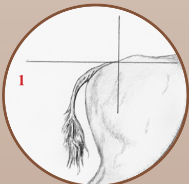
Bison at rest and not agitated.

Note: A bison tail will raise when the animal defecates (similar to positions 3 and 4) but otherwise indicates the level of stress of the animal.