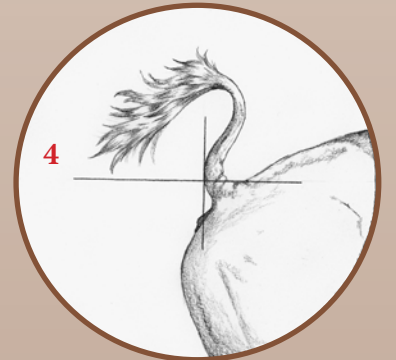
Bison is highly stressed, signaling that something is about to happen. You are too close. Move away.