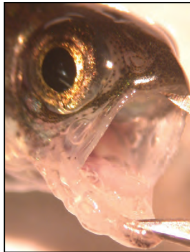
Left: Gas bubbles (arrow) trapped in capillaries of a gill lamella typical of gas bubble disease; Right: Gas bubbles in and around connective tissue of the mouth.