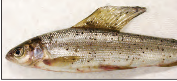
Typical black spots composed of melanin that surround encysted metacercariae of the larval genus Neascus in an Arctic grayling.