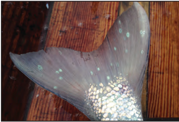
Marine form of black-spot heterophyid circumscribed by blue-green pigment on the caudal fin of a Bering cisco (photo: B. Collyard, ADF&G).