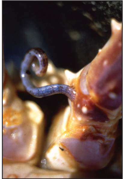
Crab leech attached to the carapace of a red king crab