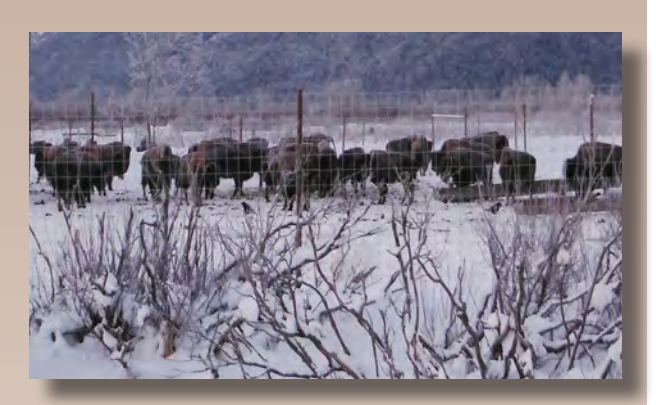
The initial release will be into a temporary holding enclosure near Shageluk for approximately two-five weeks. This will allow the bison to settle into their new environment.