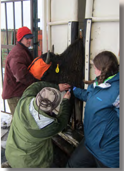
ADF&G biologists take blood samples.