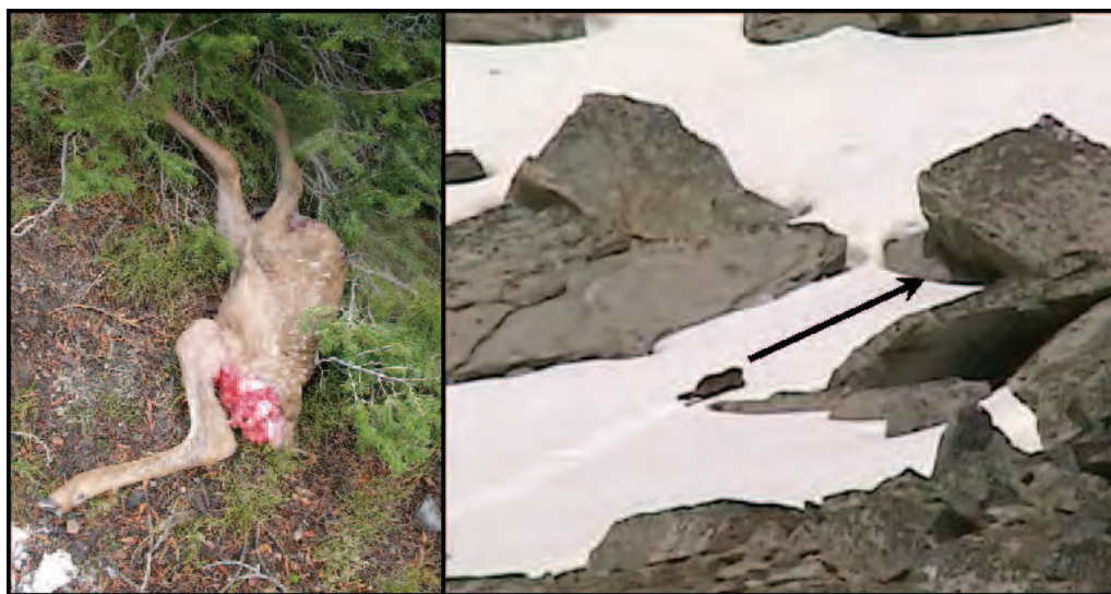
FIG. 3. —This elk calf was killed by a female wolverine ( Gulo gulo ) on 16 June 2004 in southwestern Montana. She had moved parts of the carcass to a rendezvous site where she had a cub. She dragged the remainder of the carcass to another cache site under large boulders (right photo) where there was ice that was likely to be present until autumn. Structure and cold temperatures may be critical habitat features for cache longevity because they inhibit competition from avian, mammalian (e.g., bears), insect, and bacterial competitors.

of the timing of reproductive events, summer foods appear to have an equally important role, and the limited information specific to summer diet indicates that predation on small prey occurs frequently in most areas (Gardner 1985; Lofroth et al. 2007; Magoun 1987; Packila et al. 2007). Total biomass obtained from small prey can be significant; 1 female was observed to eat 2 small mammals or ptarmigan chicks, an adult ptarmigan, a ground squirrel, and 2 eggs during a 2½-h period in June (Magoun 1987). In addition, wolverines have been documented as the main predator of woodland caribou calves during the calving season (Gustine et al. 2006), and predation on reindeer and other ungulate neonates occurs (Björvall et al.