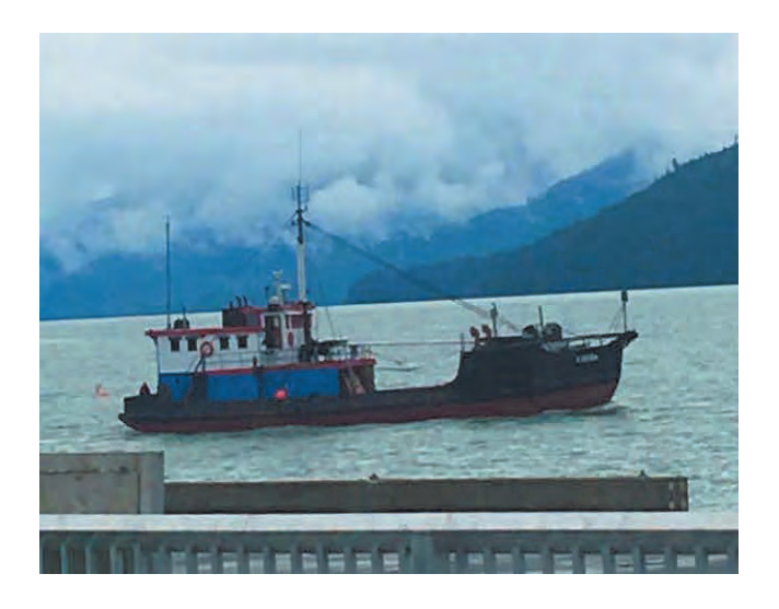
F/V Cirus Owner/Operator Pacific Marine LLC.

Machinery Caterpillar C32, 3306, cranes, 3phase electrical, carrier RSW operation 90 days 281 days at sea qualified hours and areas available upon request.