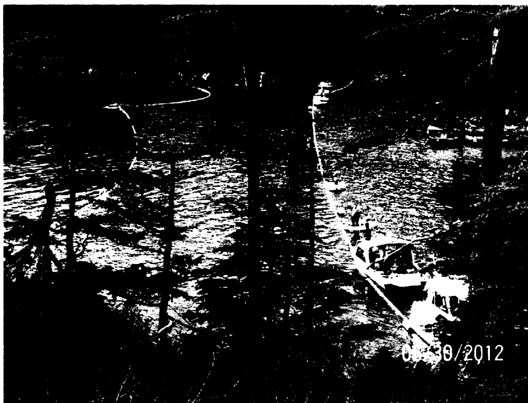
Photo 1: Cork/buoy-line marker placed seaward of the barrier net weir to preserve functionality and prevent damage and sport fishing inside of the broodstock holding area.