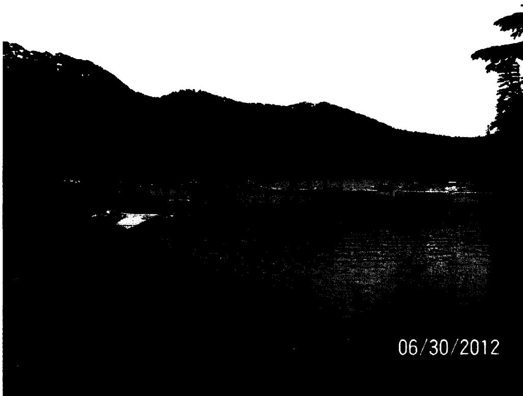
Photo 2: View of broodstock holding area from the hatchery shoreline. Boats tied to the cork/buoy-line marker.