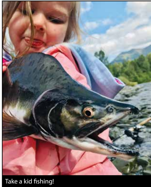
Take a kid fishing!