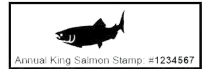
This is an example of a king salmon stamp purchased online.

Anglers sport fishing for king salmon (except king salmon stocked in landlocked lakes) must purchase a current year's king salmon stamp. Stamps purchased online can be printed immediately. If you purchase a physical stamp, it must be signed across the face of the stamp, in ink, and stuck to the back of your sport fishing license.