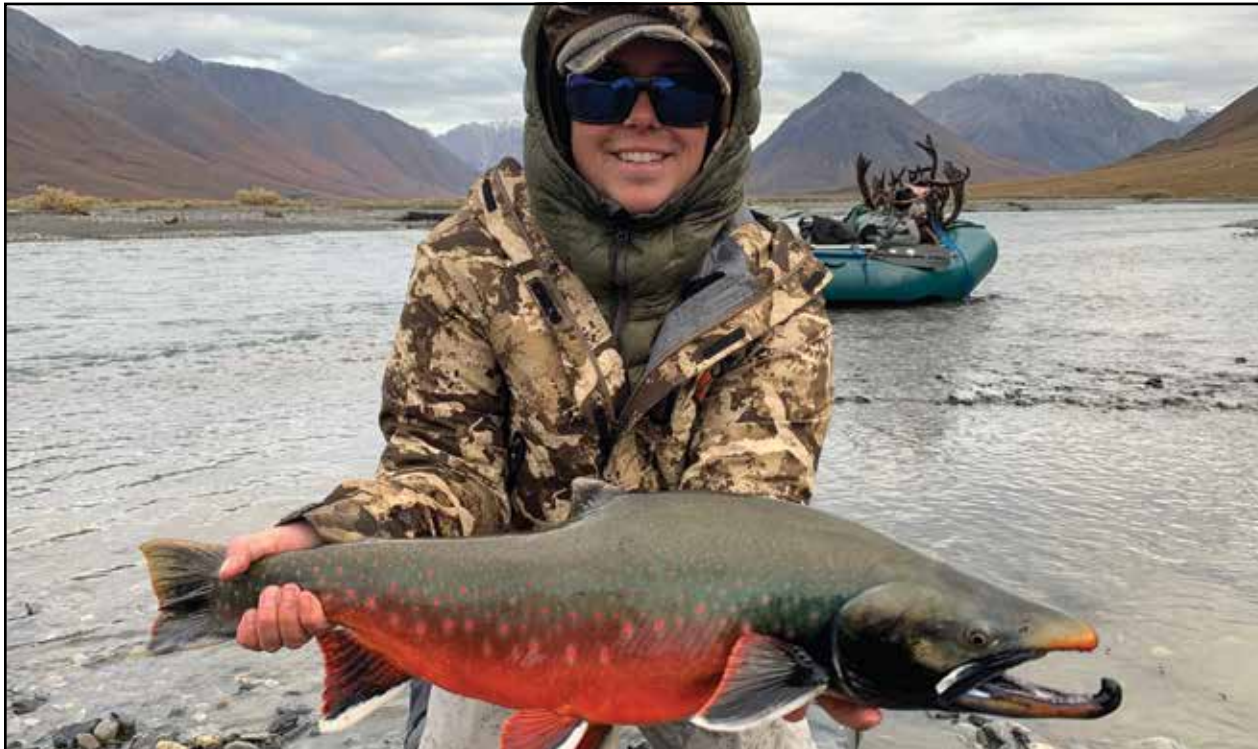
A beautiful Dolly Varden from the far north.