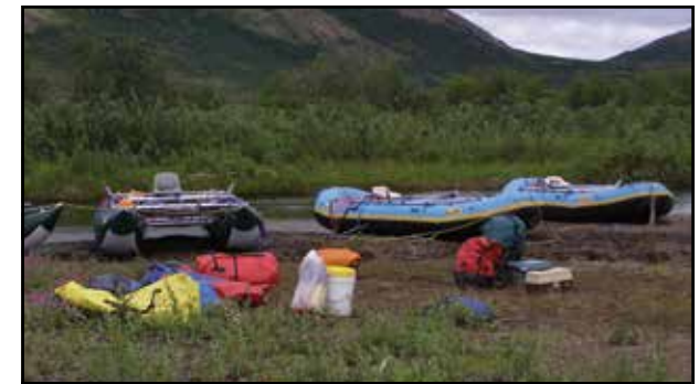
Camping on the Kwethluk.