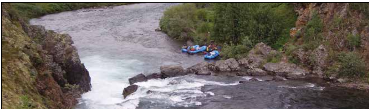
Rafters on the Kisaralik.

Fishing Reports ↪ Advisory Announcements ↪ Emergency Orders