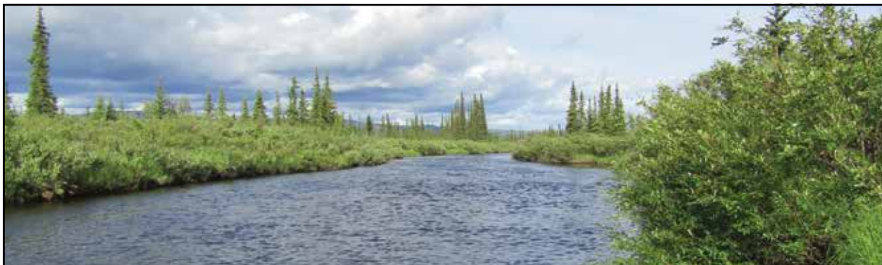
A remote stream in Interior Alaska.

Fishing Reports ↪ Advisory Announcements ↪ Emergency Orders