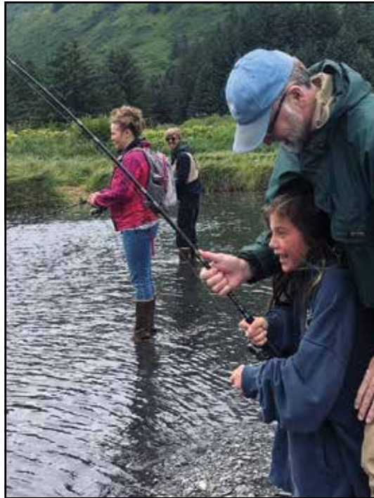
Take a kid fishing!

SS = Silver (coho) Salmon RT = Rainbow Trout KS = King Salmon