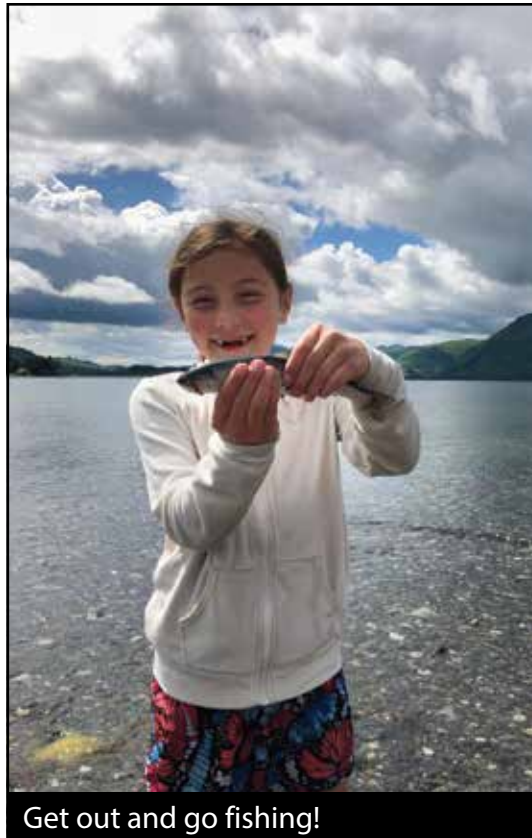
Get out and go fishing!