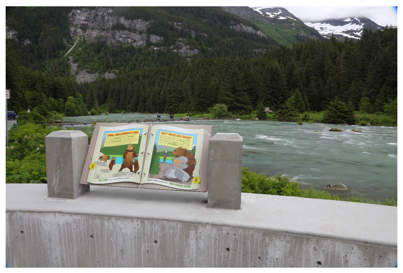
Figure 1–Installed interpretive sign.