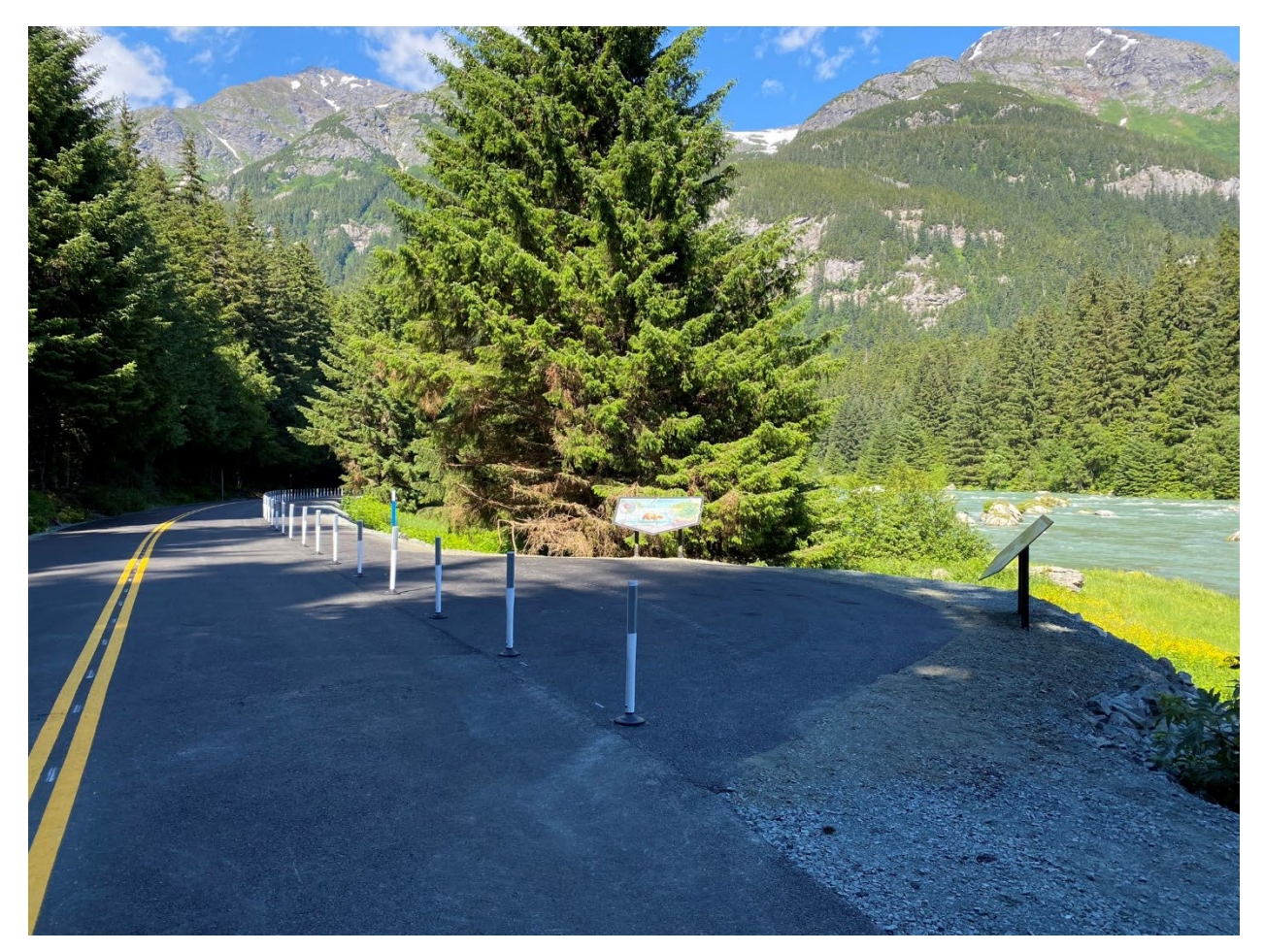
Figure 5.–Reinstalled interpretive signs at pedestrian space.