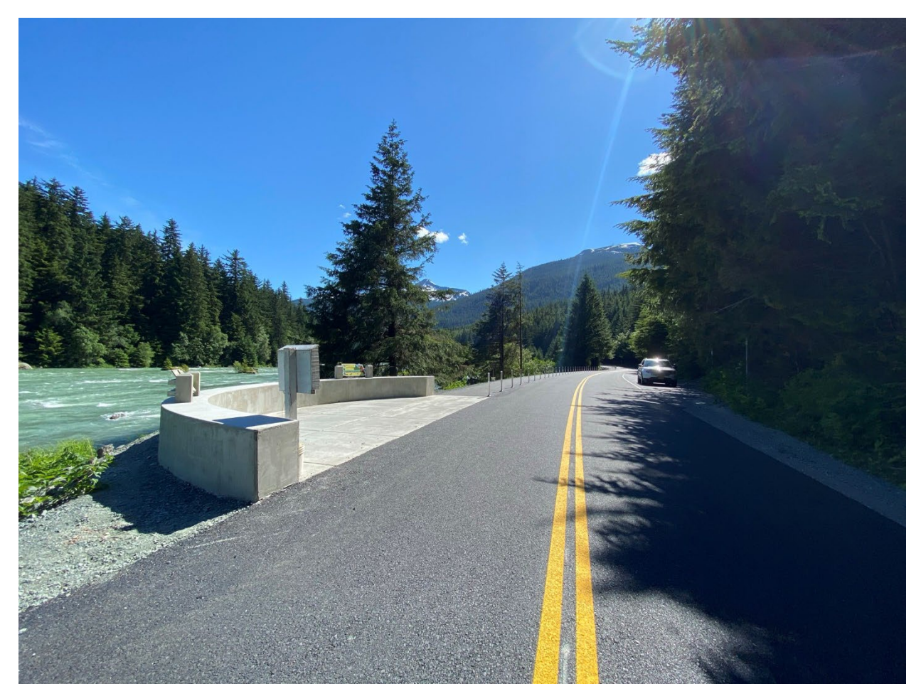
Figure 4.–Roadway striping and delineator near pedestrian area.