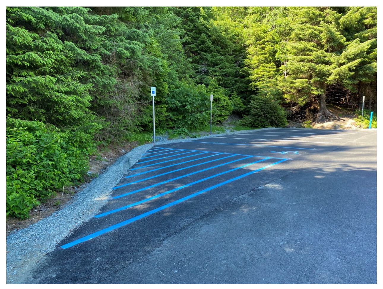
Figure 3.–Parking striping and signage.