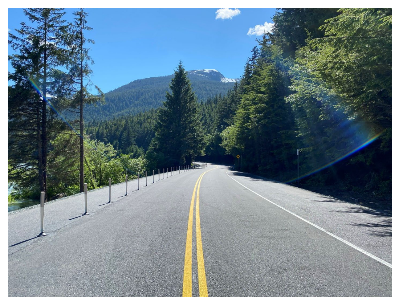
Figure 2.–Roadway striping and delineator posts.