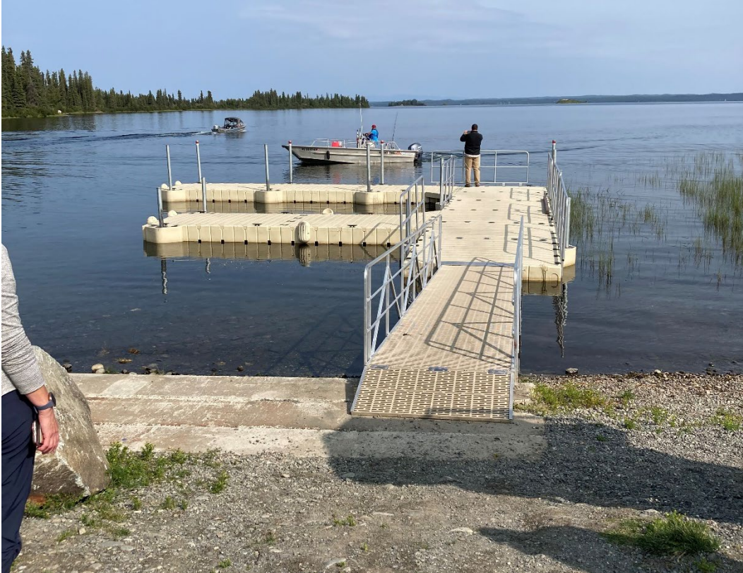
Figure 3.–Completed floating dock, August 2021.