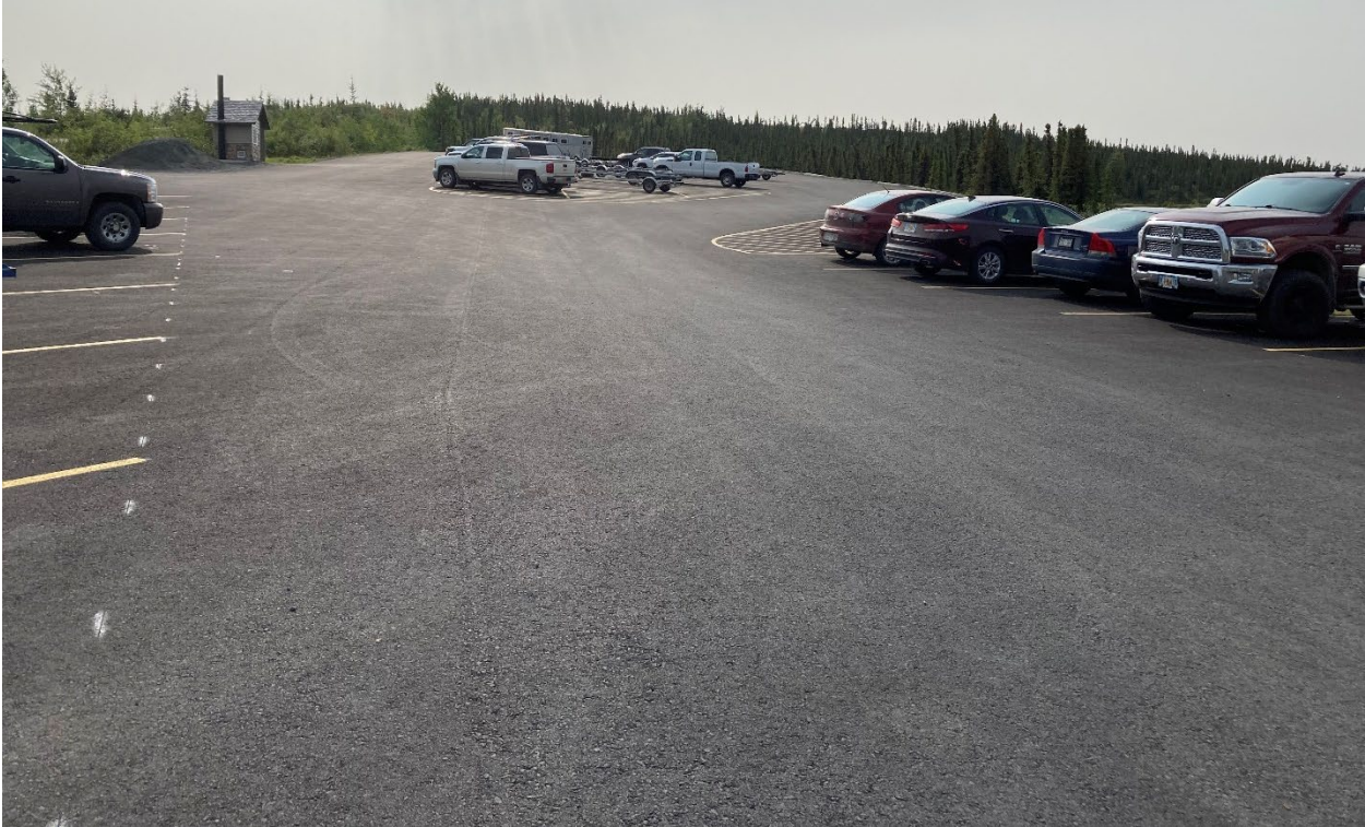
Figure 7.–Paved expanded parking area, August 2021.