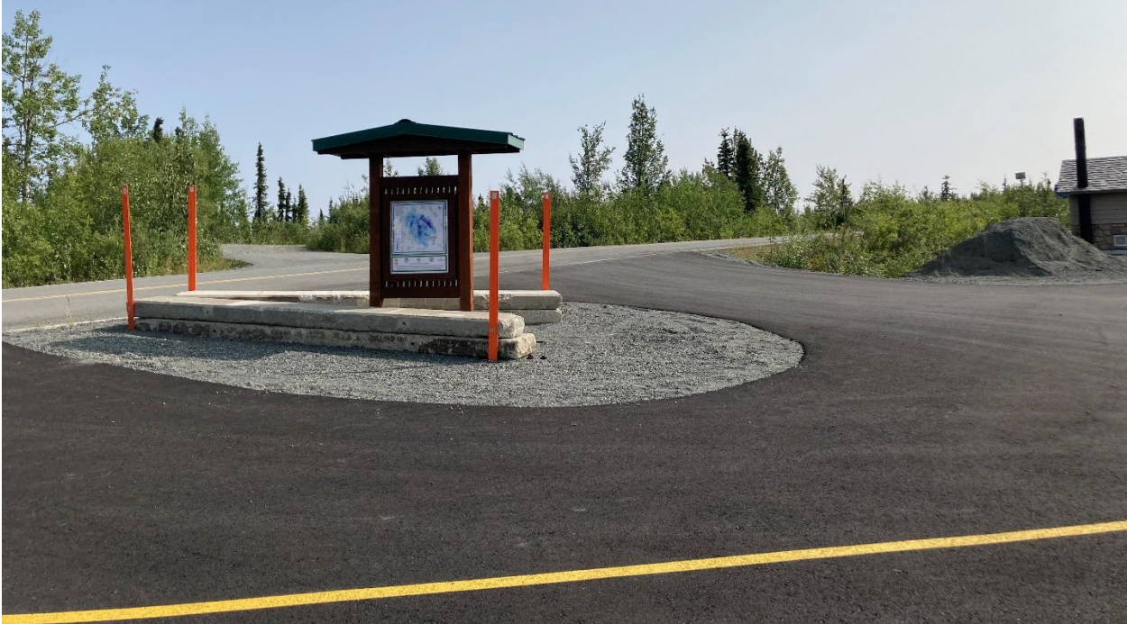
Figure 6.–Paved and striped site entrance, August 2021.