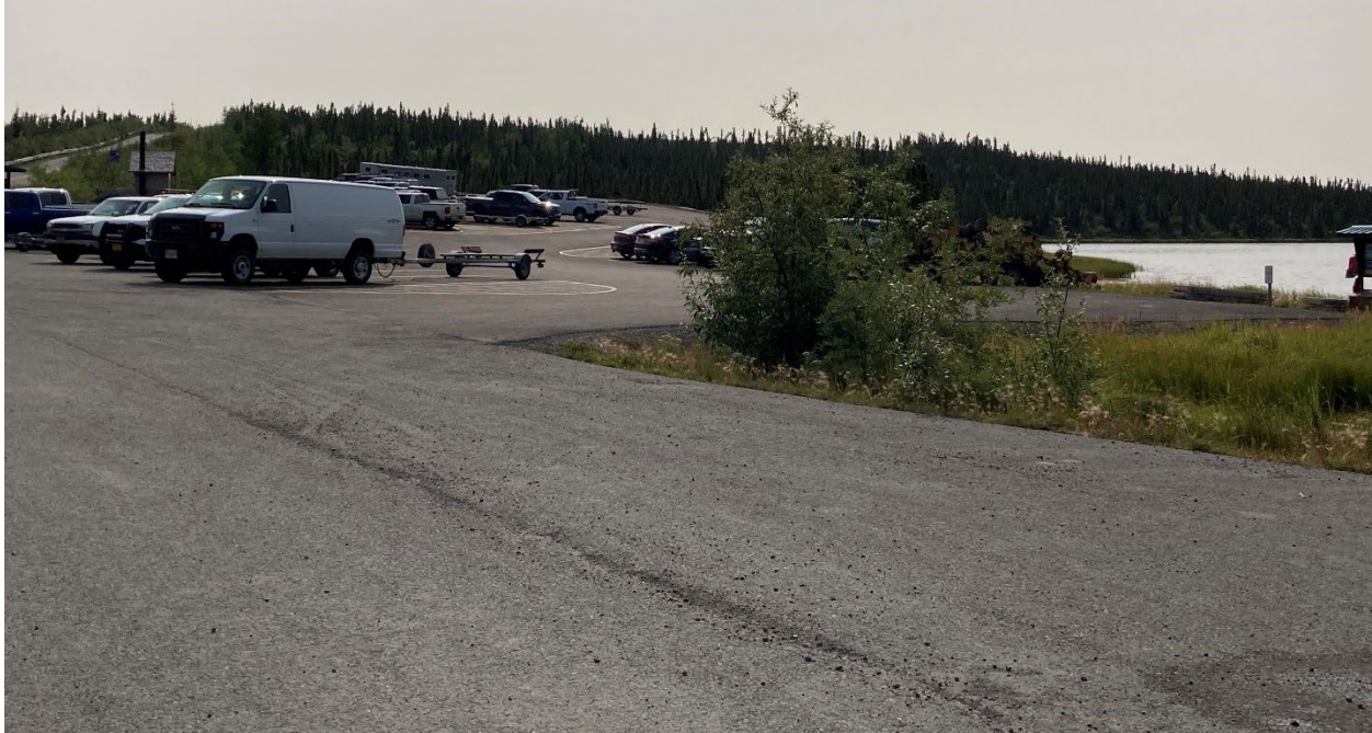
Figure 8.—Paved expanded parking area, August 2021.