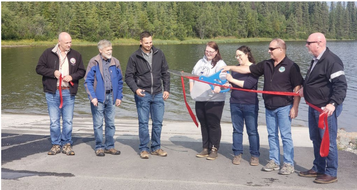
Figure 2.–Partners cutting the ribbon, August 16, 2021.