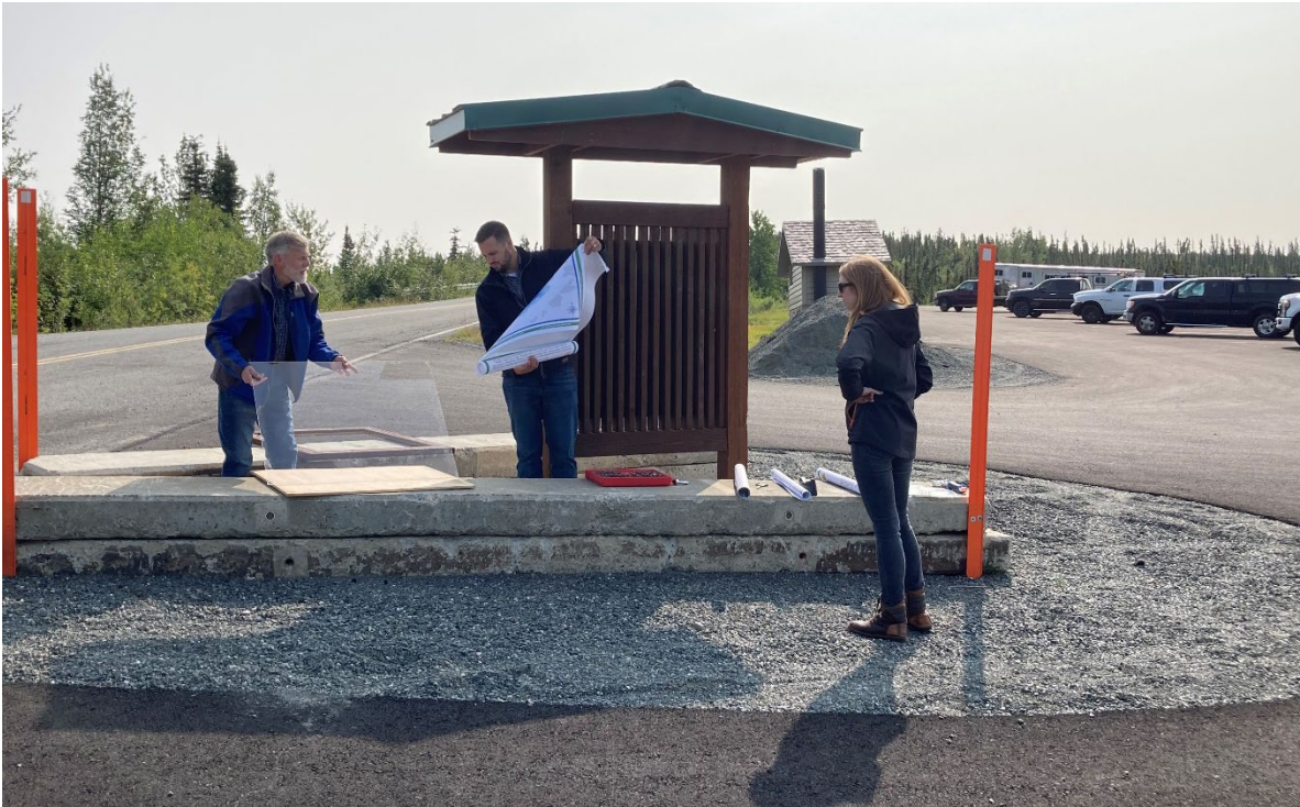
Figure 4.–Installing the new kiosk panel, August 2021.