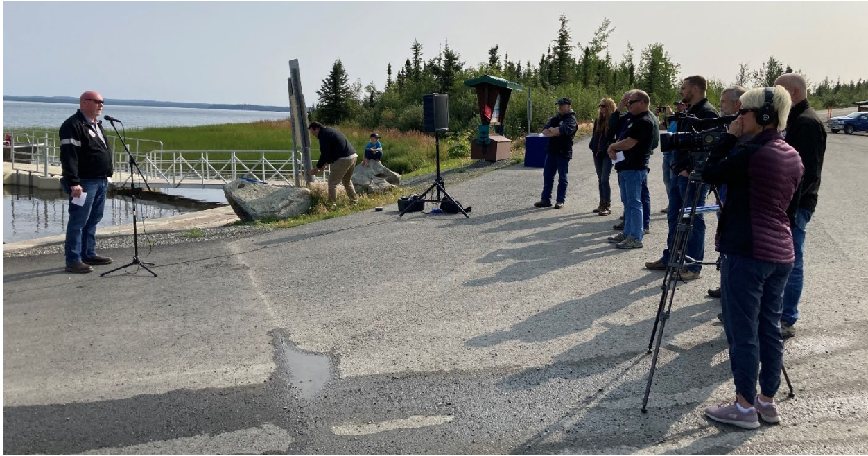
Figure 1.–Ribbon cutting ceremony, August 16, 2021.