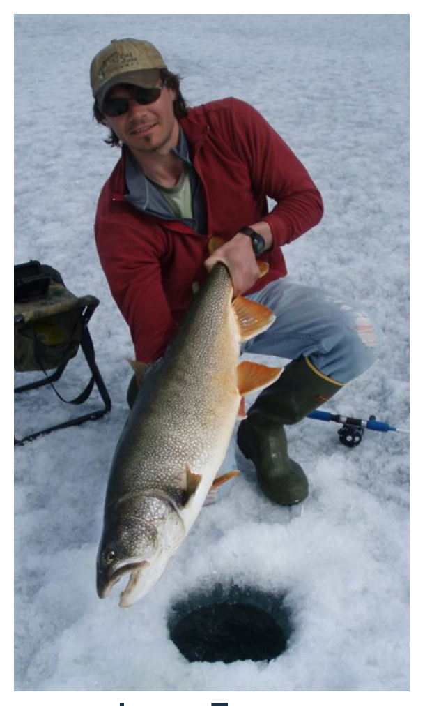
LAKE TROUT CATCH & RELEASE