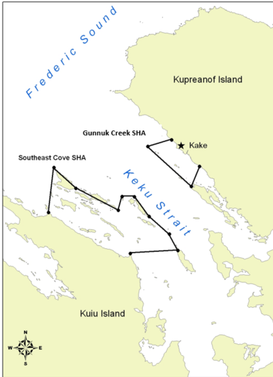
Figure 1—Location of Gunnuk Creek Hatchery SHA and Southeast Cove THA/SHA, in Southeast Alaska.