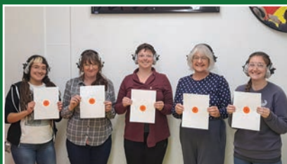
Juneau Alaskans Afield Intro to Rifle class

On Range Day we visited the Blacks Creek Shooting Range. Highlights for me included walking their hunter education field course with volunteer instructors (silhouette pronghorns instead of bears or caribou!), learning to throw a tomahawk and knife, a chuck wagon-style BBQ luncheon, and getting to act as a Cannoneer.