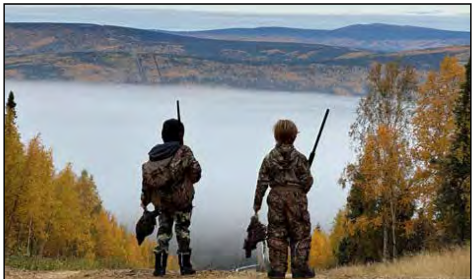
Two grouse hunters enjoying the view.

In Unit 23 , a pilot may not transport parts of big game with an aircraft without having, in actual possession, a certificate of successful completion of an ADF&G-approved education course regarding big game hunting and meat transportation in this unit; however, this provision does not apply to the transportation of parts of big game between state maintained airports. Contact the Kotzebue ADF&G office at 1-800-478-3420 or (907) 442-3420 or for more information visit http://hunt.alaska.gov/ .