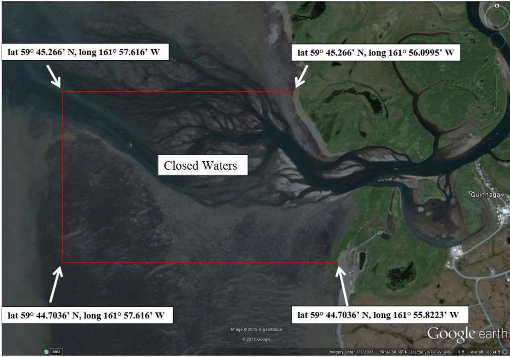
Figure 2. Closed waters for District 4, Quinhagak.