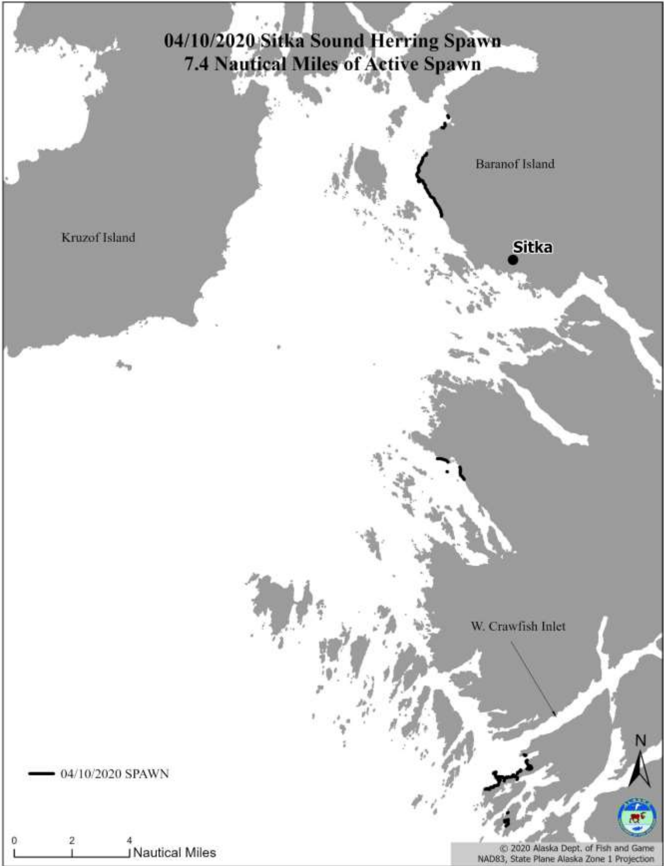
Figure 2. Active herring spawn observed in Sitka Sound on April 10, 2020.