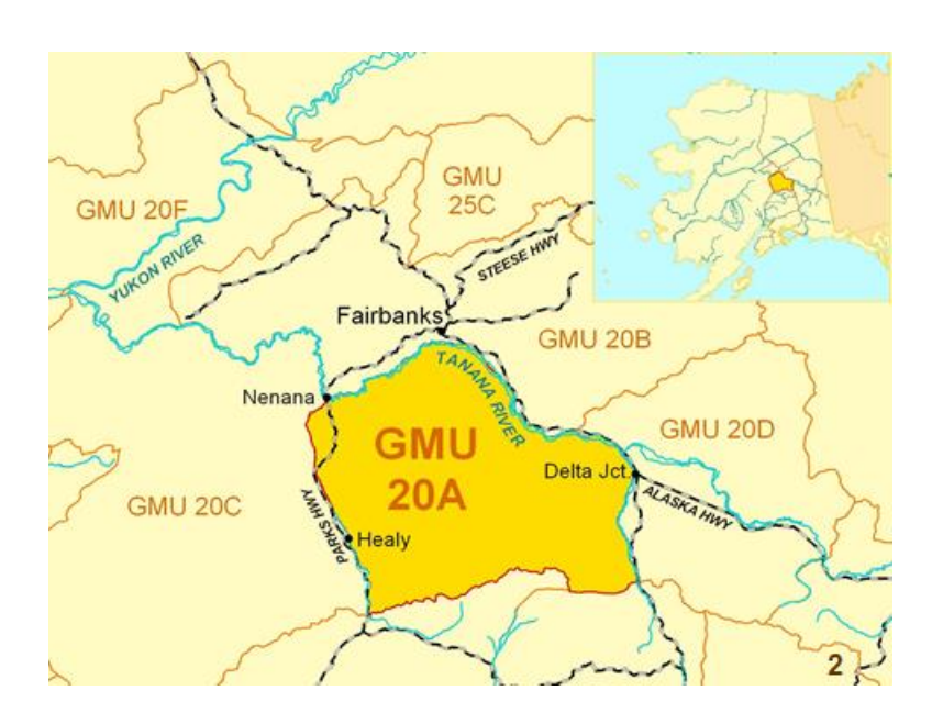
Figure 1. Location of Unit 20A.