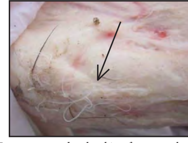
Legworms under the skin of a moose leg.