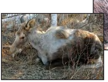
Moose with winter tick showing hair loss from scratching.

Action: Please report any ticks, lice, fleas (except ticks from squirrels and lice from wolves) to dfg.dwc.vet@alaska.gov to help biologists control this parasite.