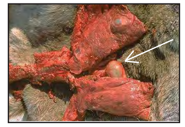
Tapeworm cysts in moose lungs.