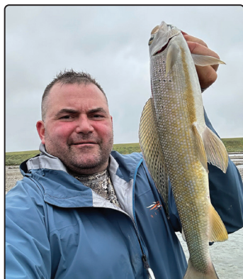
Echooka River success!