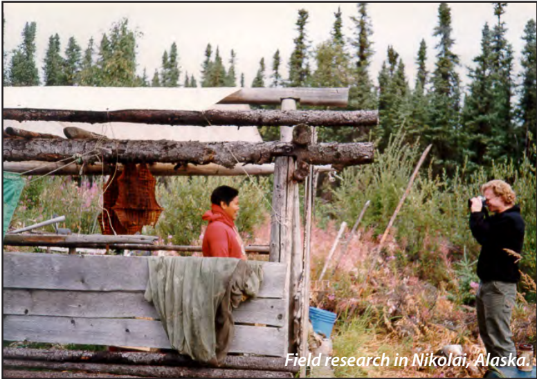
Field research in Nikolai, Alaska.