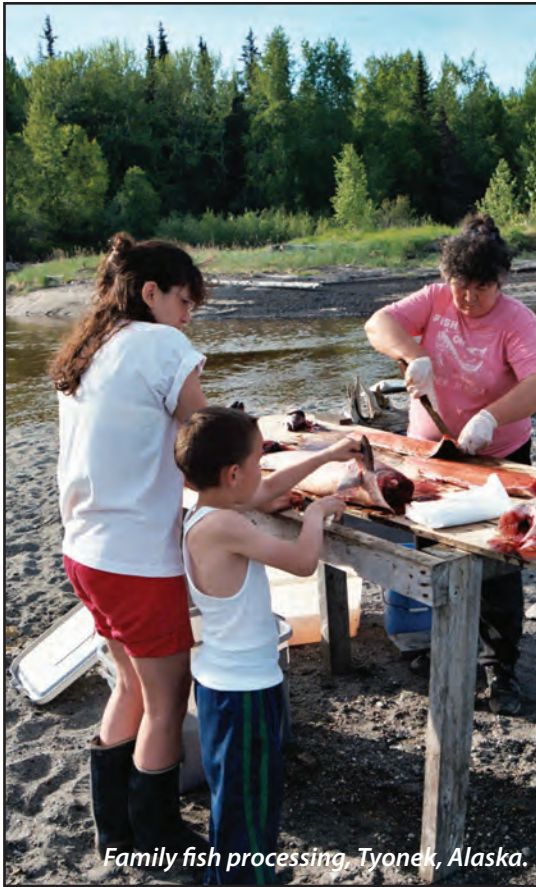
Family fish processing, Tyonek, Alaska.

Under Alaska law, the Division of Subsistence of the Alaska Department of Fish and Game is charged with conducting research on "all aspects of the role of subsistence hunting and fishing in the lives of residents of the state."