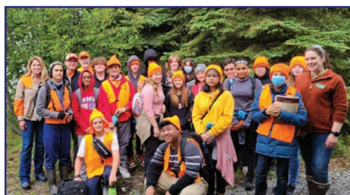
Anchorage School District Migrant Education hunter ed class

It's been a busy summer for the HIT Program around the state and I wanted to share some photo highlights.