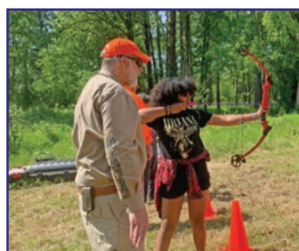
Getting kids excited about archery at Potter Marsh Discovery Day