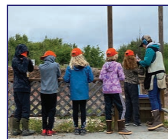
Shotgun shooting at Outdoor Youth Days Camp

We'd love to share more photos with your fellow instructors. Photos can be emailed to ginamaria.smith@alaska.gov .